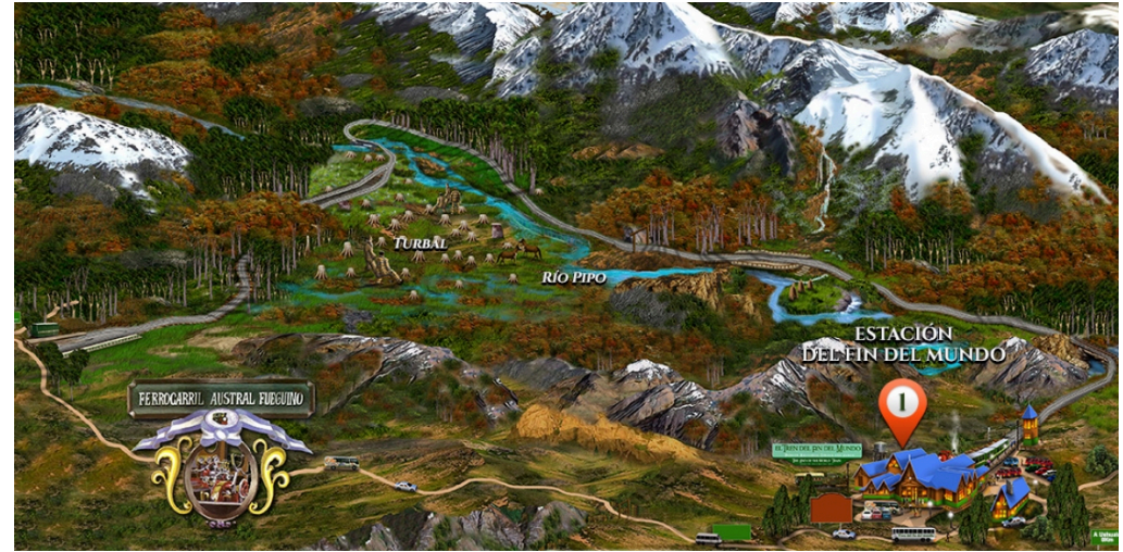
Illustrative Image of the Route

Accepted payment methods: Visa, Mastercard, American Express, cash in pesos, dollars, euros, or reais.