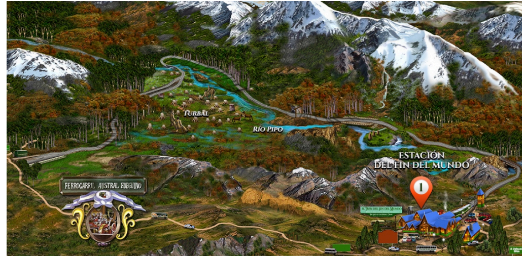
Illustrative Image of the Route

Accepted payment methods: Visa, Mastercard, American Express, cash in pesos, dollars, euros, or reais.