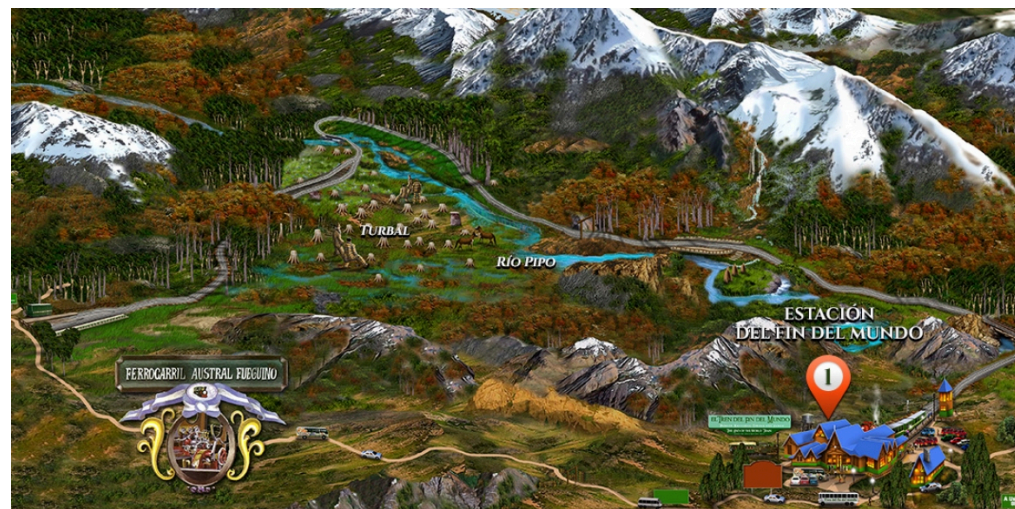
Illustrative Image of the Route

Accepted payment methods: Visa, Mastercard, American Express, cash in pesos, dollars, euros, or reals.